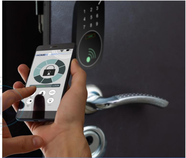
Lock & Unlock